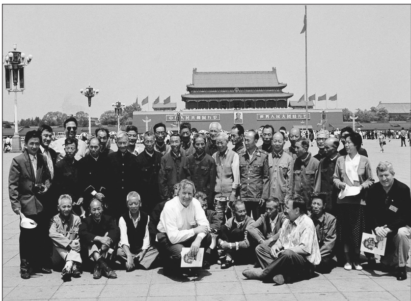
This is the Team Canada small business mission visiting Tiananmen Square.